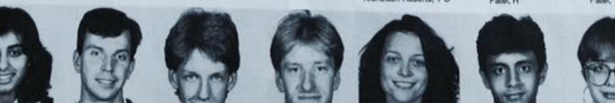
Row of 7 student portraits