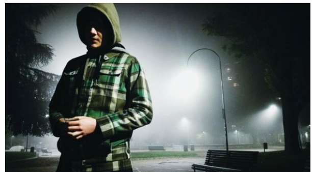
The National Crime Agency estimates that a gang can make an average of £2,000 a day from a county line

Private school pupils at risk of 'county lines' exploitation, warn agencies – click here to read the story